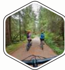
MT. SEYMOUR, BC