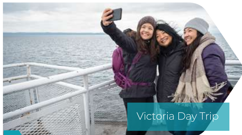
Victoria Day Trip