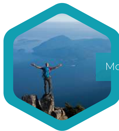
Mount Seymour, BC

SELC Language College organizes all kinds of activities on and off campus. We have student and staff-led clubs for sports, music, dance, and conversation practice. Throughout the year we host different activities: bowling, potluck, seawall biking, field trips, and more.