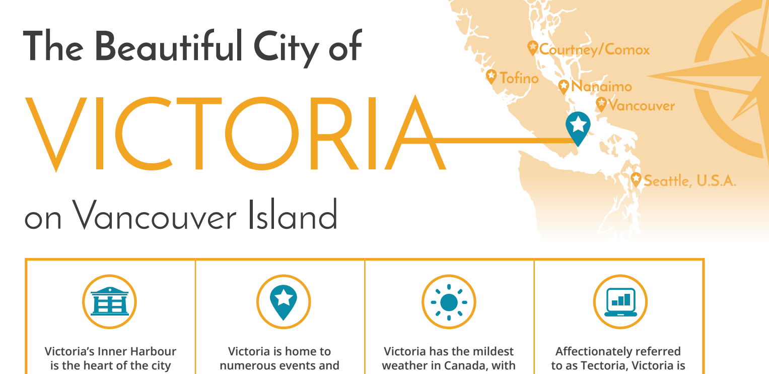
is the heart of the city and is surrounded by historic buildings such as the Empress Hotel, Royal BC Museum and BC Legislature.