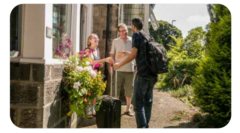
Accommodation is hugely important to make sure you get the most out of your trip. CES have a number of different options available for you to chose from.

Our administration teams are also vital to ensure you have a successul and relaxed experience.