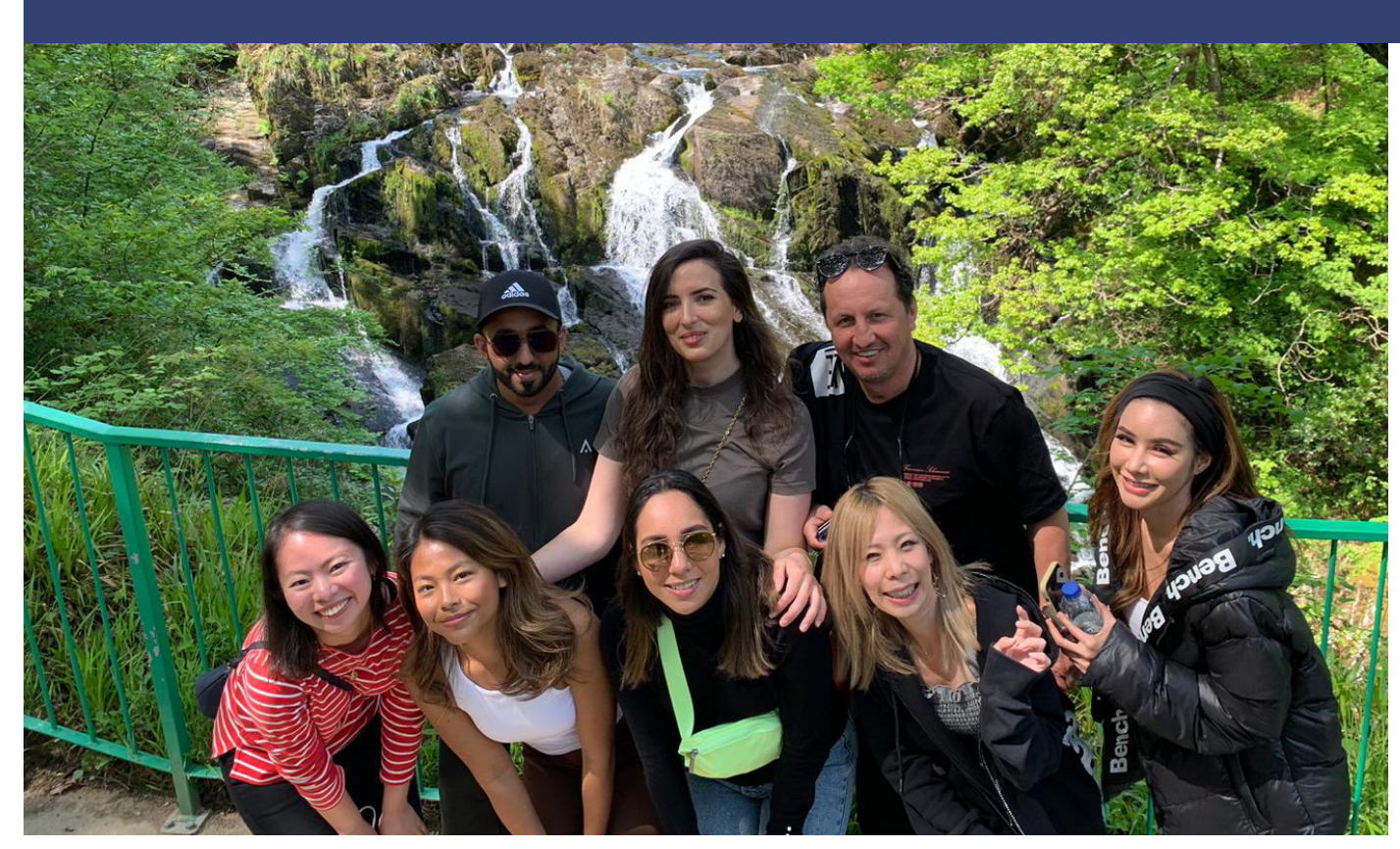
Swallow Falls Betws-y-Coed, North Wales Summer 2023