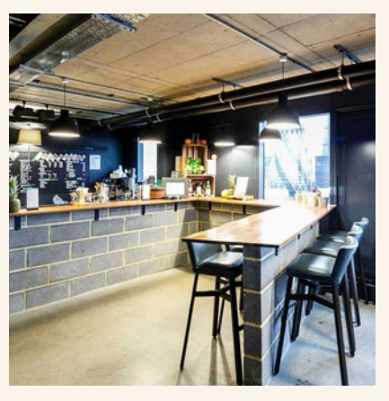
Student residence examples: Drapery Plaza, Don Gratton House, Hayloft Point, Chapter