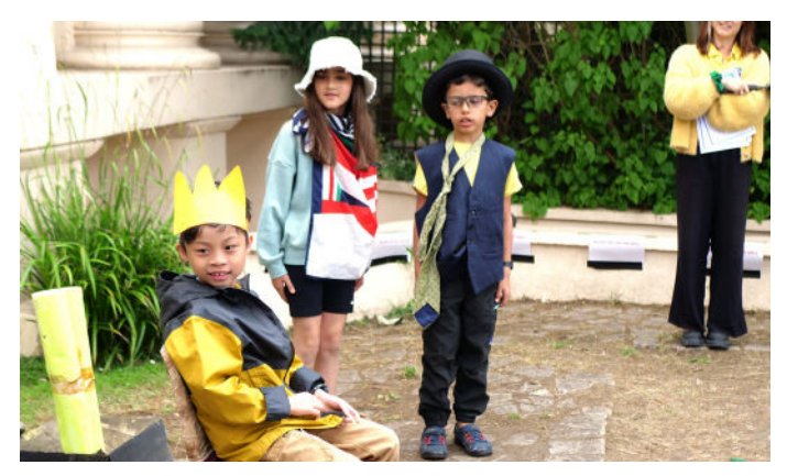
▲ Open air theatre in the garden