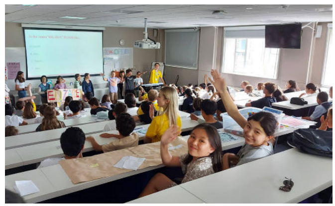
▲ Friday presentations