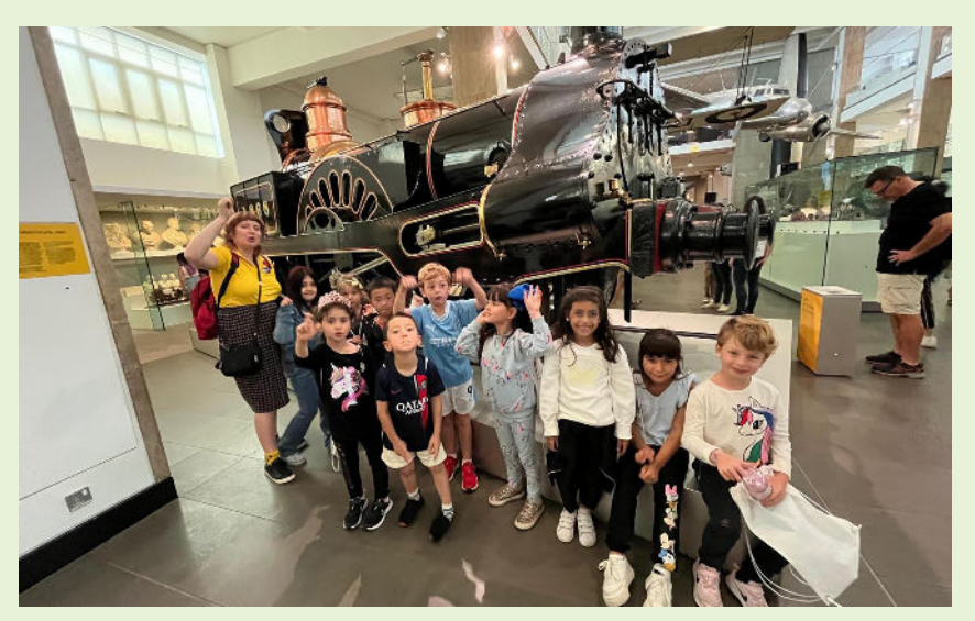
▲ Science Museum