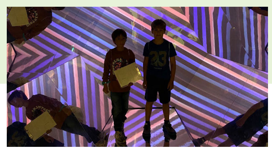
▲ Twist Museum