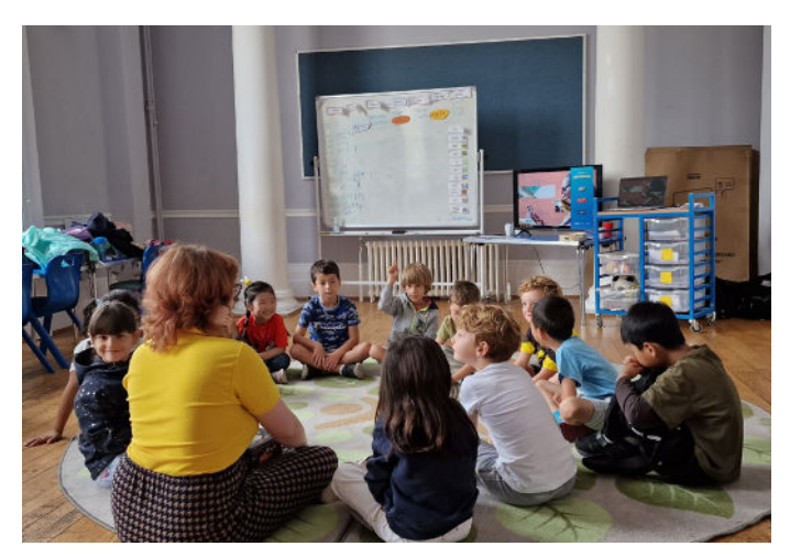
▲ Circle time for 5-6-year-olds