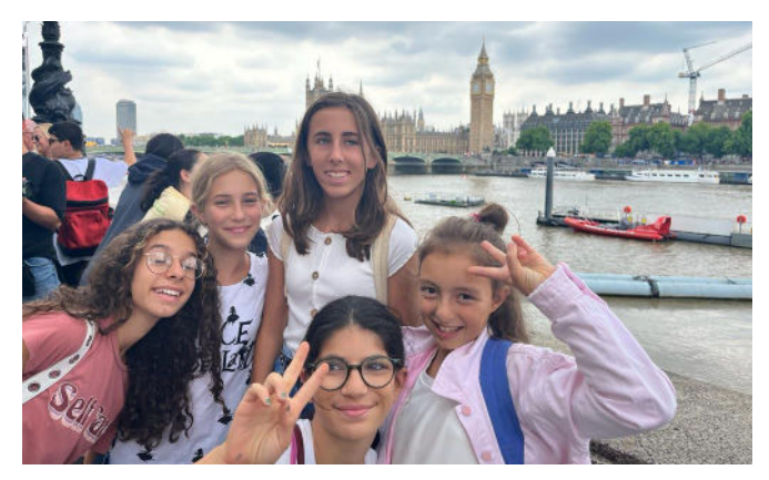
▲ London Eye and Big Ben