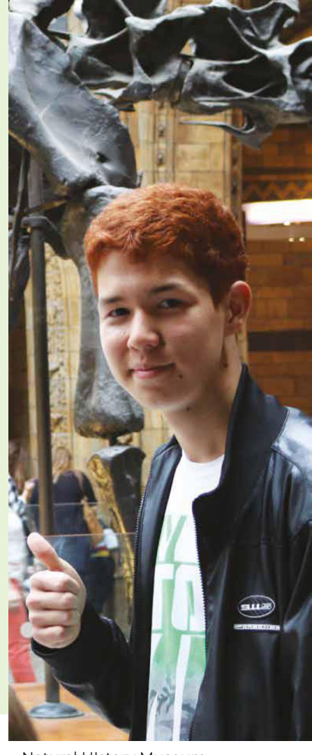
▲ Natural History Museum

Our 5-9 year olds have 1 halfday excursion to a suitable location for their age. Students are accompanied by staff on trips.