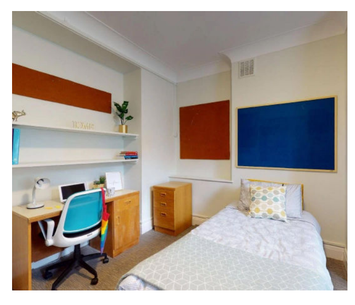
▲ Nutford House student residence

Our students over 12 years old who stay with a homestay never stop practising their English. Students usually request their own room, unless travelling with a sibling or friend where a twin is available. Breakfast and dinner is with the host who often plans a trip at the weekend with the student.