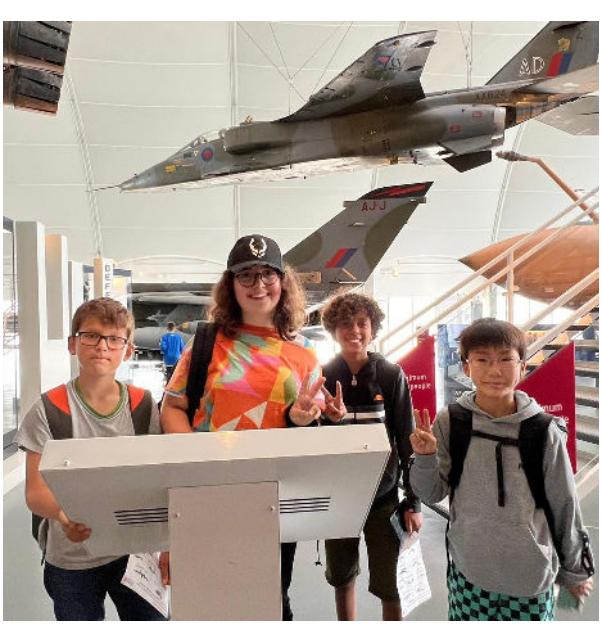
▲ RAF Museum