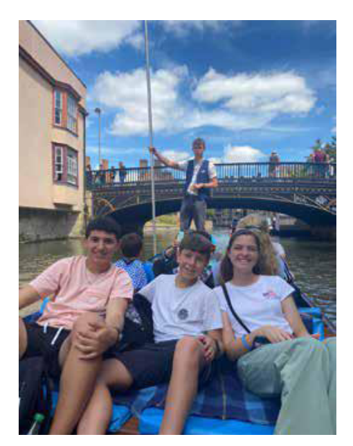
▲ Cambridge Punt