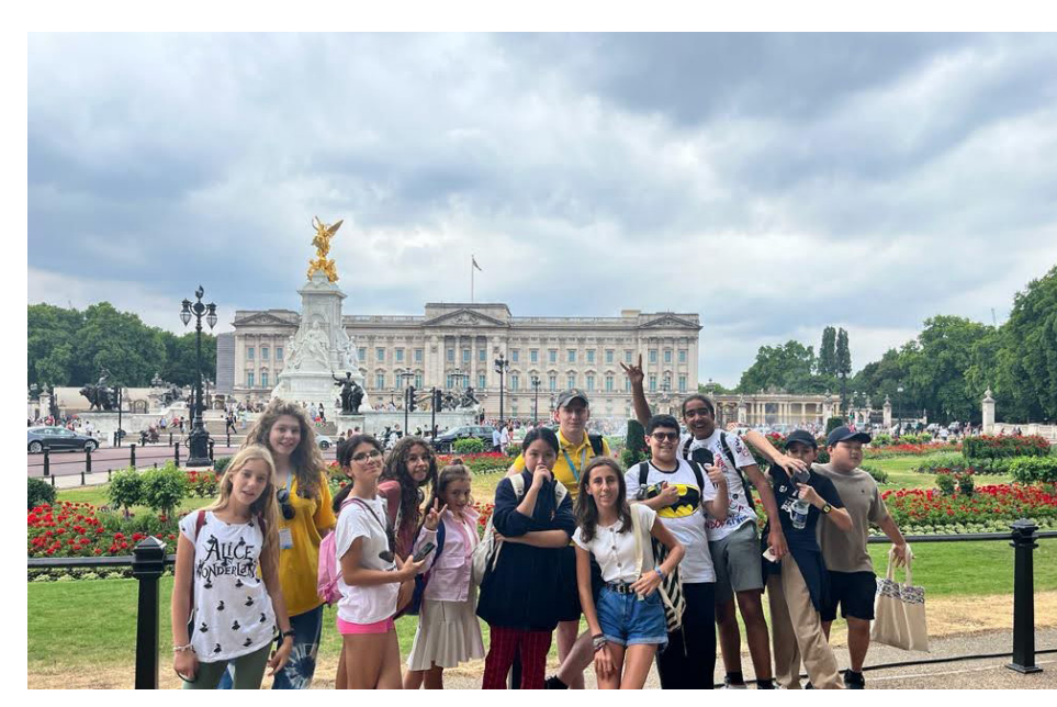
▲ Walking tour to Buckingham Palace