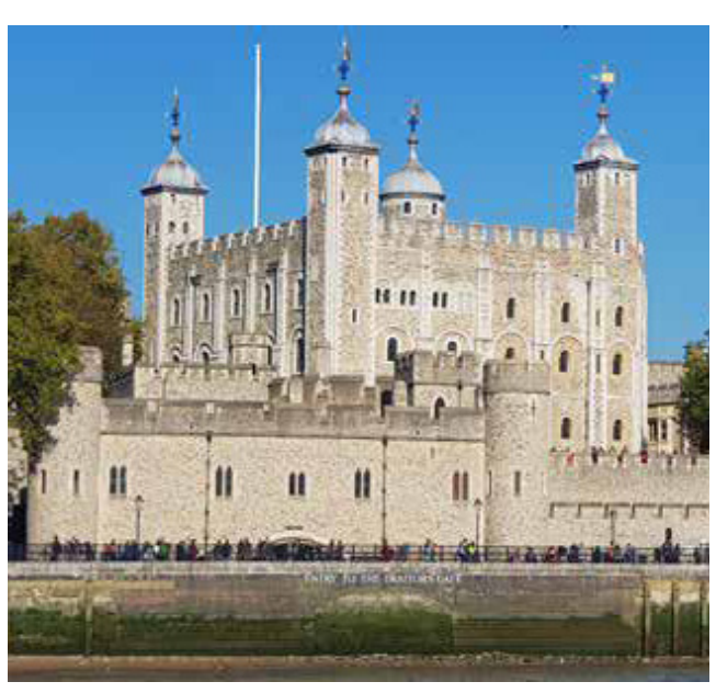
▲ Tower of London