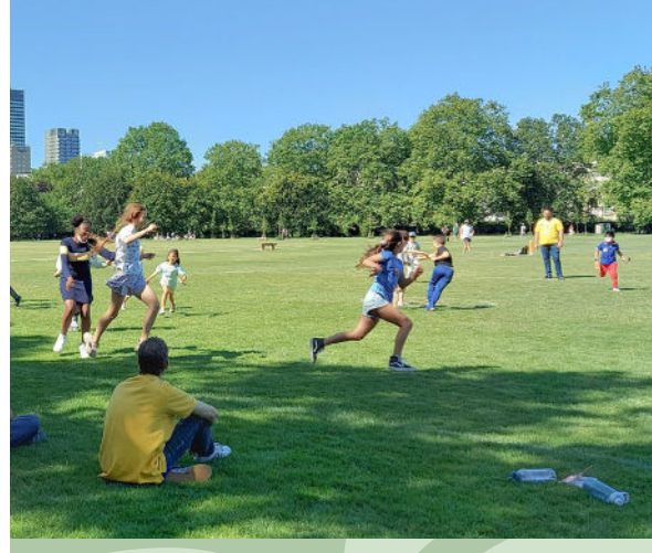
▲ Sports in Regent's Park