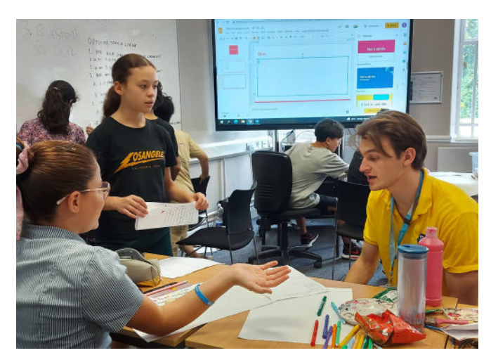
▲ English lessons