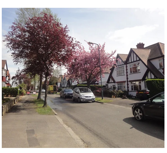
▲ Junior homestay