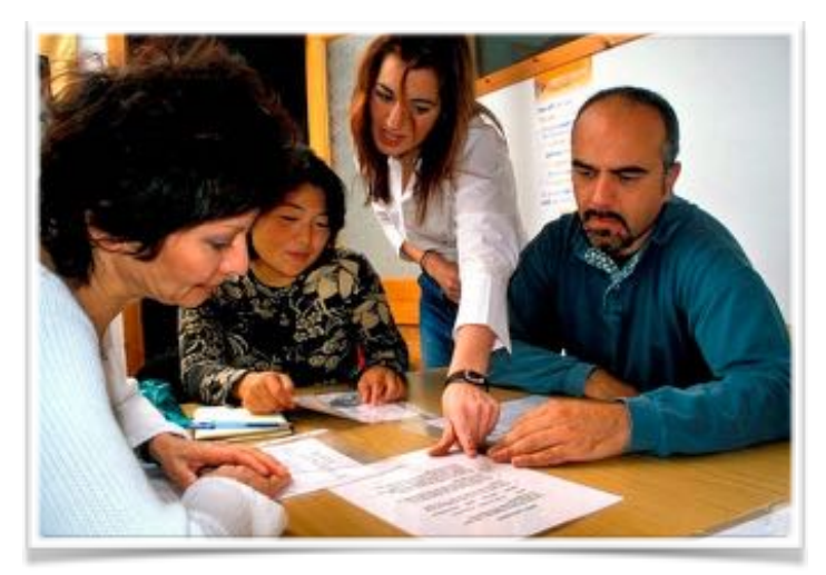
English for business and work