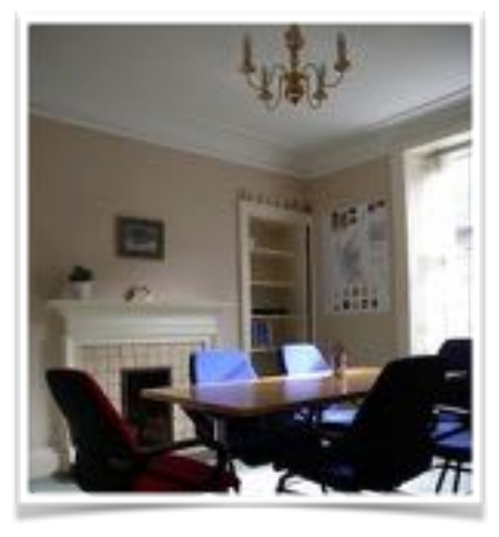
Georgian house with classic features

Teaching takes place in an attractive Georgian house, which maintains many of the classic features of a building from that era. The building has been refurbished to provide a comfortable and calm learning environment.