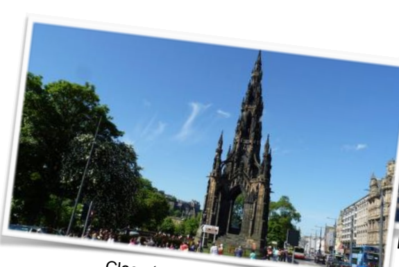
Close to many attractions

ECS Scotland is located in the centre of Edinburgh. The school is easily accessible from all parts of the city by bus and is within easy walking distance of many of the main attractions, parks, restaurants, cafes and shops.