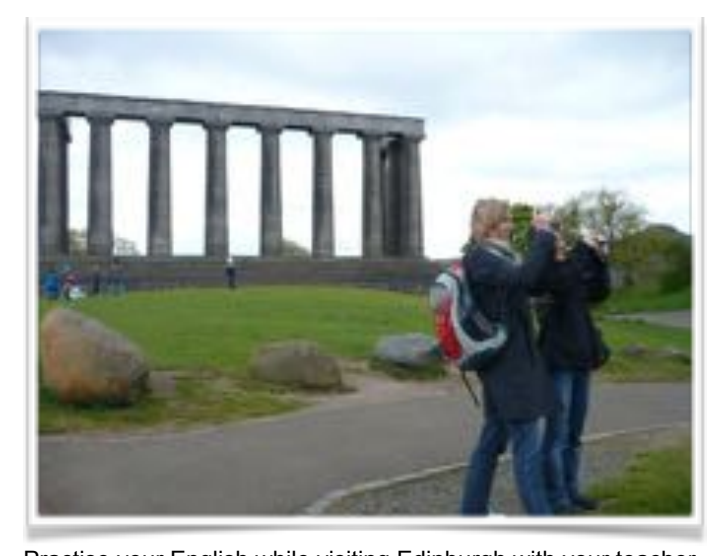
Practise your English while visiting Edinburgh with your teacher

Individual Tuition courses are available for all levels from