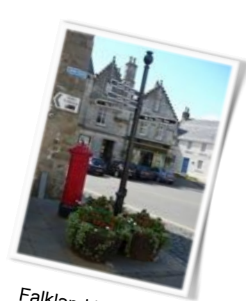
Falkland Palace and village