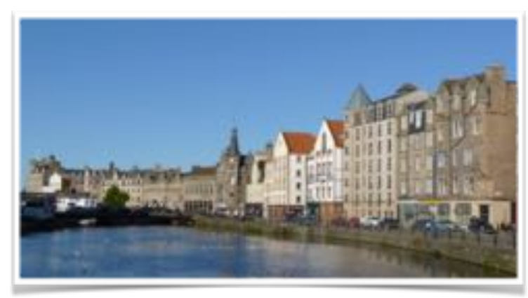
Learn English in the morning and visit Edinburgh in the afternoon

The afternoons are free for you to explore the city on your own or take part in optional activities arranged by ECS Scotland. Whisky tasting, a Scottish cookery course, a historical and scenic walk, visit the Royal Yacht Britannia, Edinburgh Castle or go shopping.