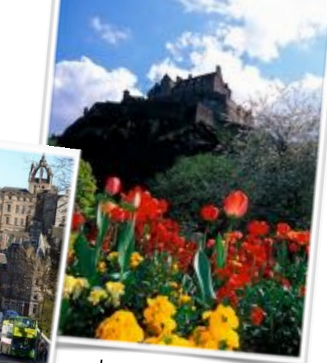
Located in the city centre