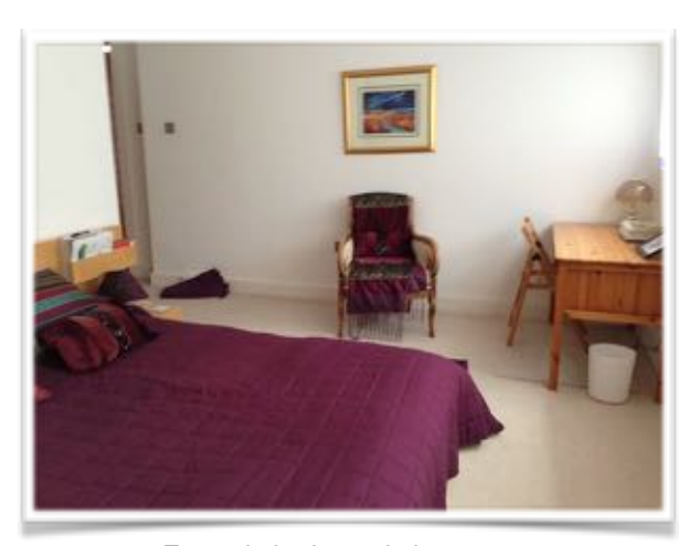
Example bedroom in homestay

Homestay accommodation is provided in comfortable and conveniently located homes all over Edinburgh.