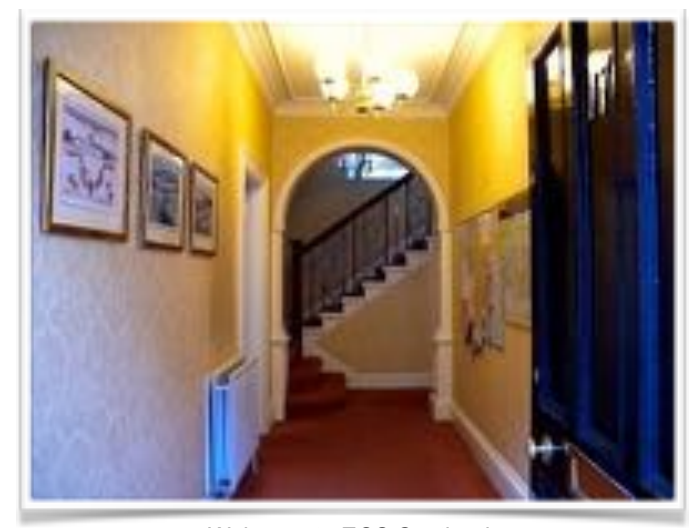
Welcome to ECS Scotland

ECS Scotland is a family-run, British Council accredited English language school founded in Edinburgh in 1995.