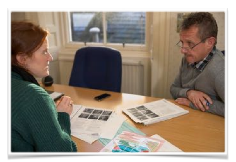
Specific English 1-to-1 classes in the afternoons

The aim of these courses is to develop overall English communication skills alongside more specific English language areas such as; business, medicine, law, environmental science, politics, aviation, tourism, journalism, sales, marketing, politics. Other specific needs or topic areas can be covered on request.