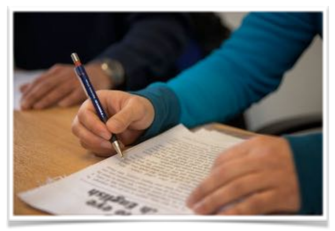
Improve your Academic English before starting university

Intensive Academic English courses are available throughout the year as a Combination Course for students who require assistance with proof-reading their written work, or help preparing a presentation or project in English.