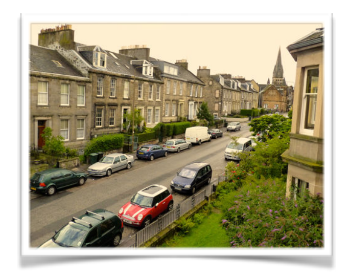
Example location of homestay accommodation