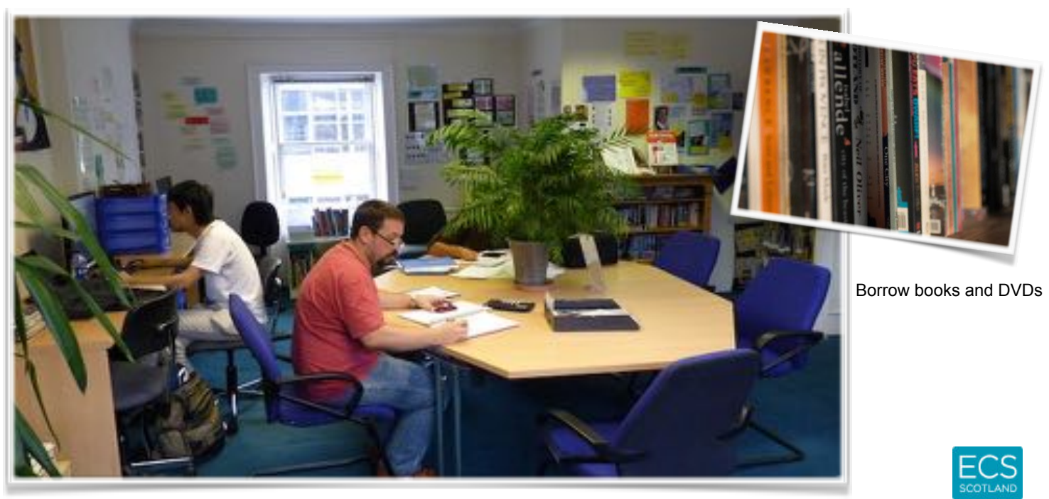
Self-study area. Take advantage of extra listening, reading and grammar material.

We encourage all students to use the resources available to consolidate what is learnt in the classroom.