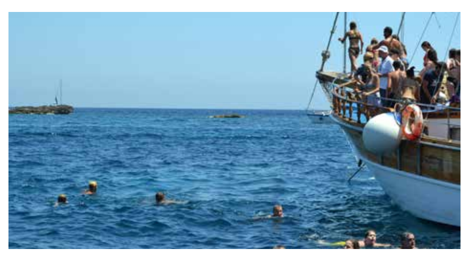
Comino Boat Trip