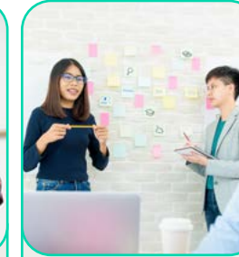
Future Leaders - Young Entrepreneurs 14 to 17 years old

Gain first-hand experience of what it's like to be an entrepreneur; developing skills in budgeting, communication, project planning, marketing, and team-building.