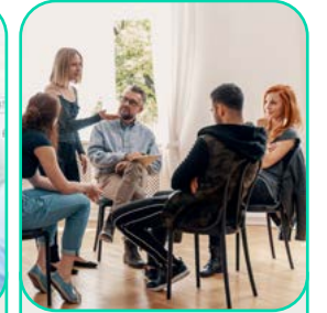
Future Leaders - Solving Global Complex Problems 15 to 17 years old

Gain first-hand experience of what it's like to be an entrepreneur; developing skills in budgeting, communication, project planning, marketing, and team-building.