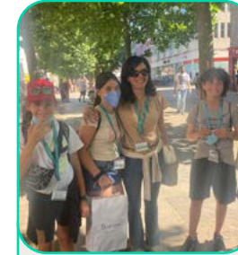
English Plus Explore 12 to 17 years old

Our Young Learner courses combine English training with fun activities, exam preparation, or even taking the first steps to an international career.