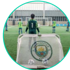
Manchester Football Education Programmes