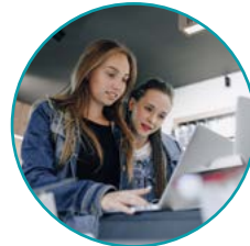
NEW LOCATIONS COMING SOON