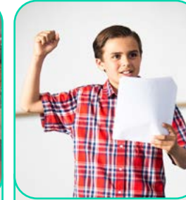
Performing Arts 15 to 17 years old

This summer school is a fantastic way for teenagers to learn English and discover the history and culture first-hand. Students can take this programme in London or Malta.