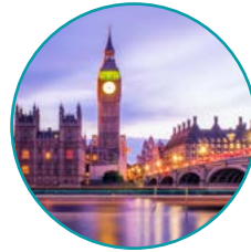
London Winter & Summer

Grow your future opportunities at one of our prestigious centres in the UK or Malta